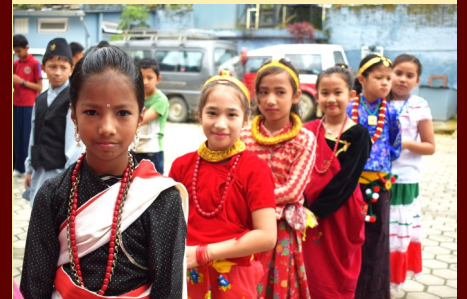
Traditional Dress of Nepal

On the 21 st of September which is the International Peace Day, on this day for the past many years, Elim has integrated this day as the Elim's International/Cultural Day. This is a day to celebrate and share the elements of the various cultures or ethnicity with other members of the school community through story-telling, food, dance, arts etc. to make each culture unique. Although, Elim is a small school, yet we have always had more than six or seven nations represented in our school community.